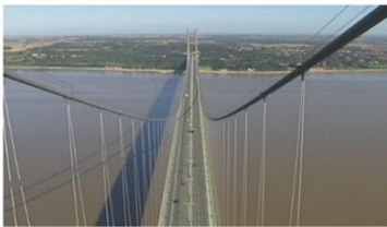
The Humber Bridge - for 17 years it was the world's longest single-span suspension bridge, and was officially opened by Her Majesty the Queen in July 1981 – surfaced with machine-lay TLA mastic gave over 20-years of service