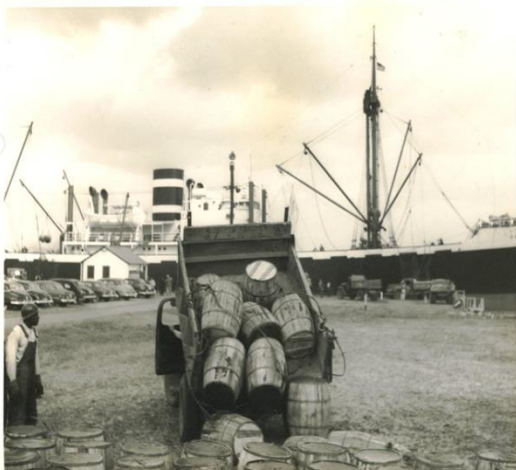
TLA in Drums- 1950 Georgia USA