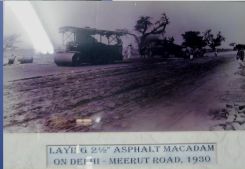
Trinidad Lake Asphalt (TLA)